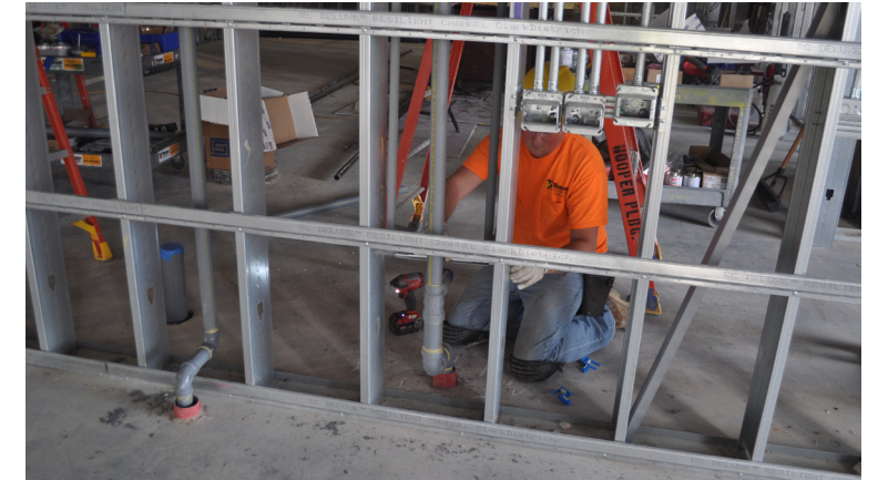
Above: CPVC lab waste piping installation.

Advancing science education is one of our state's areas of leading investment. On this score, Hooper Corporation was proud to have an important part in expanding one of our state's leading publicly-supported universities. We know that the science labs and instructional space will ensure excellent science education for our future leaders.