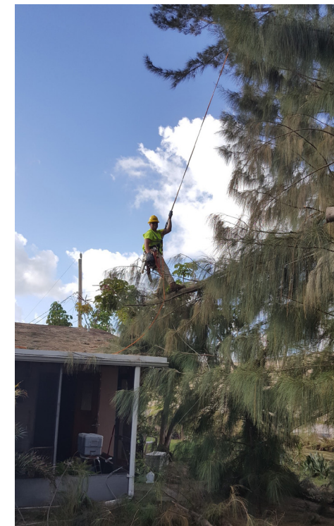
Below: A Hooper line clearance arborist removes an Australian pine that was broken during the storm from a single phase line.