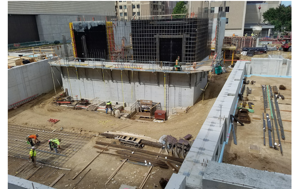
Above: The lower level and foundation of the building have been poured, and mechanical work will begin soon.

UW-Madison has a goal of achieving the Leadership in Energy and Environmental Design (LEED) silver rating for new construction on this project. The goal of becoming LEED certified is to improve performance in metrics such as energy efficiency, water conservation, CO2 emissions reduction, improved indoor environmental quality, and stewardship of resources. For plumbing, this means low water consumption fixtures in the