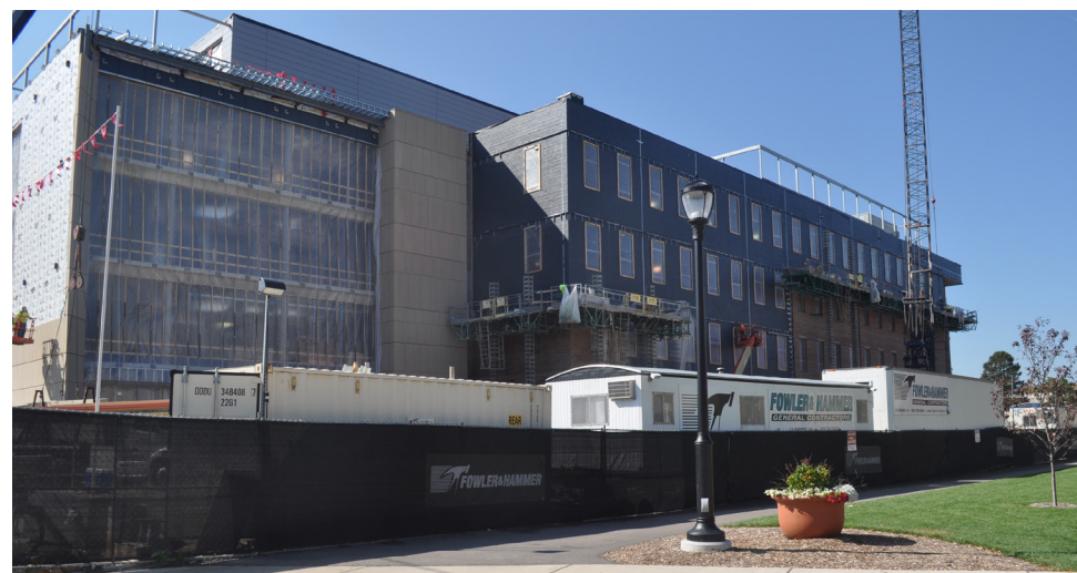
Above: An artist's rendering of the new science labs building; external views of the building progress.