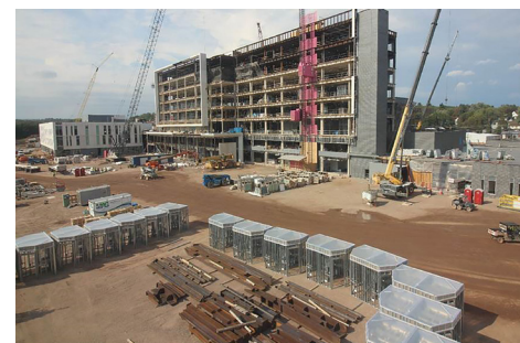
Above: South eastern view of the project, with the clinic building on the left. In the forefront, prefabricated bathroom pods are ready to be hoisted to the sixth floor.