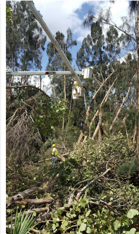
Above and Right: Two trucks, with the aid of a climber, remove uprooted Australian pines laying across a three phase line with a capstan winch.

Your crew just got our power back up down here in Port St. Lucie, Florida. Thanks for helping us. Good bunch of guys!